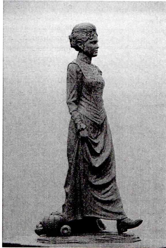
Statue of Helen J. Stewart

This work is a culmination of events that began in September 2008 when various community groups such as the Nevada Women's History Project, League of Women Voters, Daughters of the American Revolution, Nevada Council for History Education, Mesquite Club and Christ Church Episcopal Ladies Guild